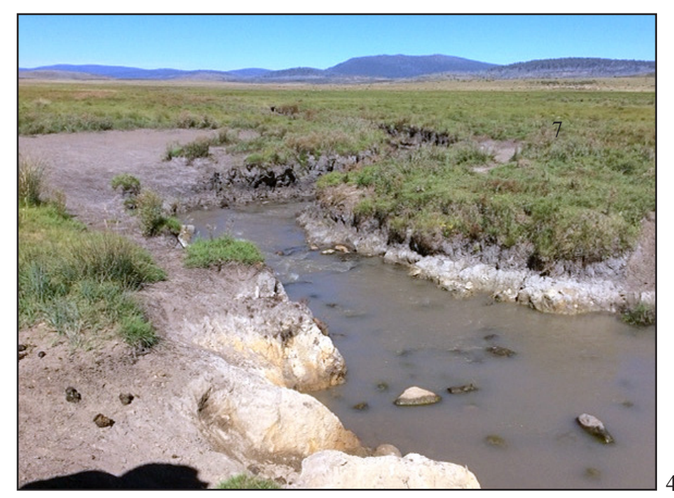
Walking north along Currango Creek, from about 1km above the Causeway (1)