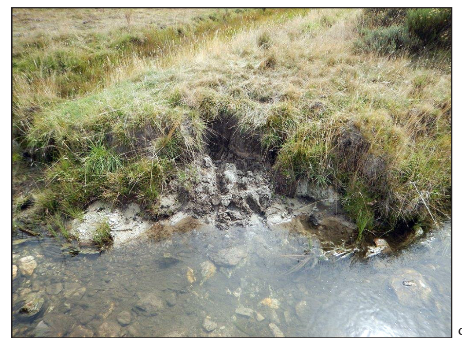
Walking south from the Confluence of Currango Creek and Gurrangorambla Creek